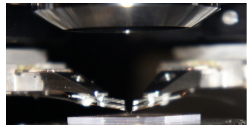
Left: Schematic for the excitation of a superfocusing surface plasmon-polariton at a metalized fiber tip by resonant coupling to a propagating fiber mode. Right: Two-tip nearfield scanning optical microscope for direct measurement of the optical near-field Green's function of photonic nanostructures.